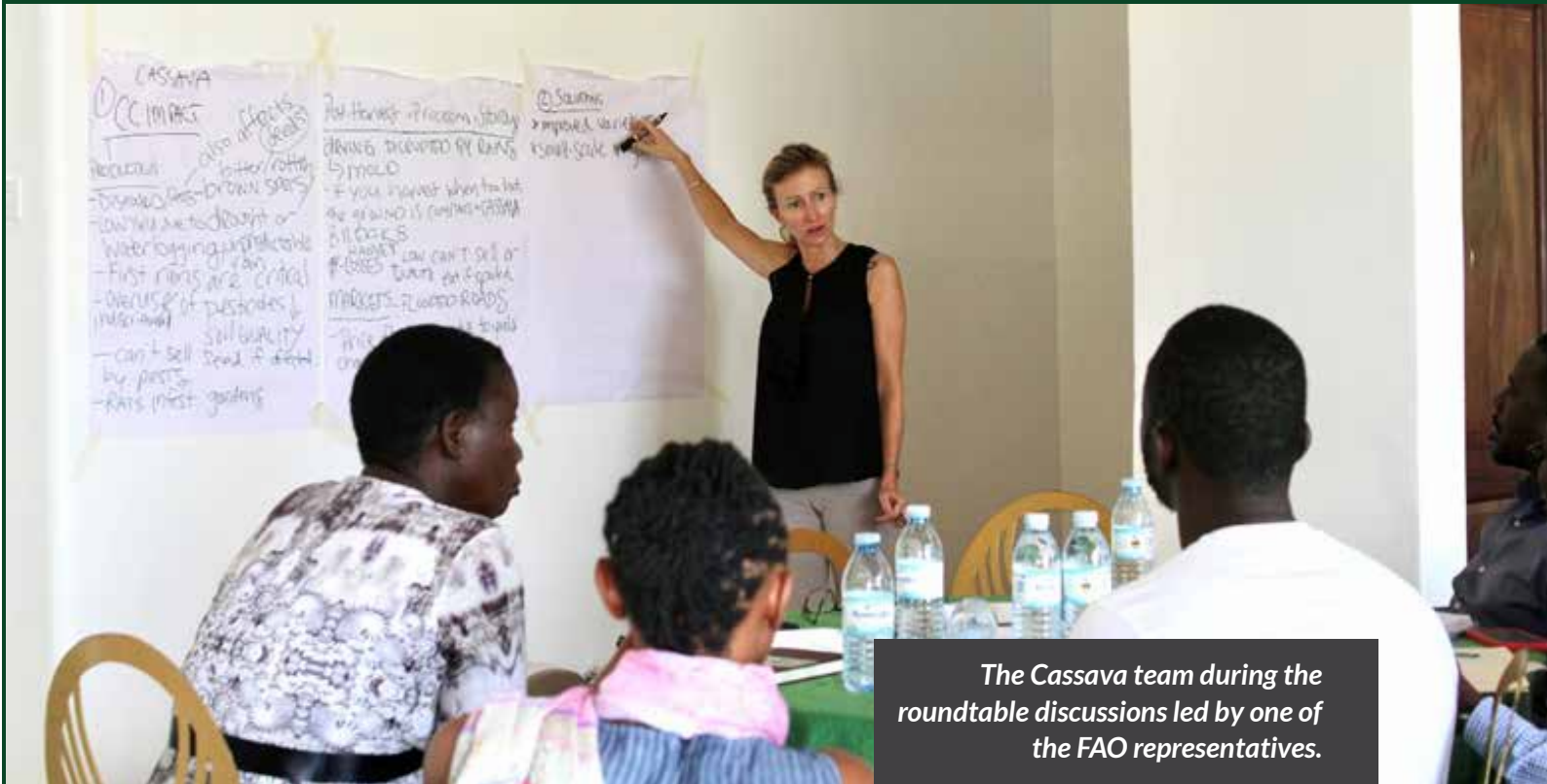
The Cassava team during the roundtable discussions led by one of the FAO representatives.

On October 31, 2023, Regenerate Africa played host to an essential Roundtable meeting at our main conference room, bringing together key players in the Ugandan agrifood industry to delve into the critical topic of climate action. This gathering was organized in partnership with the Food and Agriculture Organization of the United Nations (FAO) and the United Nations Development Programme (UNDP) under their Program on Scaling up Climate Ambition on Land Use and Agriculture through Nationally Determined Contributions (NDC) and National Adaptation Plans (NAP) – known as SCALA. The primary objective of this session was to engage agrifood companies and actors,